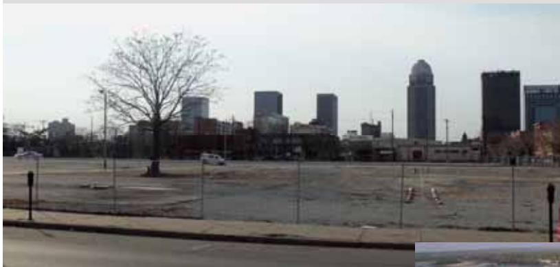
'Nucleus' , a research development, has yet to break ground at Preston and East Market Streets.