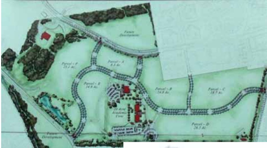
'Shelby Hurst' a research and office park, is now being built on the U of L Shelby Campus, off Hurstborne Parkway near Shelbyville Road.