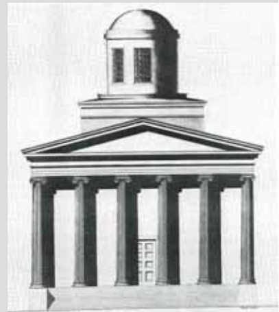
Above: Second State Capital Building by Gideon Shryock, 1827.

fifteen years after completion of the building. The wood work is to be painted with three coats of white lead and oil. The interior is to be plastered with two coats and white-washed so as to adhere and not rub off. The building is to be covered with yellow poplar shingles. All the floors are to be made of ash. There is to be a brick pavement six feet wide around the house. A good cellar under the whole building with good substantial doors and grates. Copper gutters and tin pipes spouts and stones under the spouts are to be made in every necessary place. The gutters to be of copper. The bricks are to be laid in sand and lime mortar and the stone work in lime and gravel. One coat of plastering is to be put on before the wood work is done. The windows above and below are to have each twenty-four lights of 10 by 12 and the lower sashes to be moved up and down secured by catches and good substantial locks and keys to be put upon all the doors.