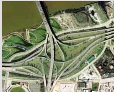
Below: Satellite view of metro Louisville, WITHOUT the Ohio River, which demonstrates amount of open land on Indiana side as opposed to Kentucky side.