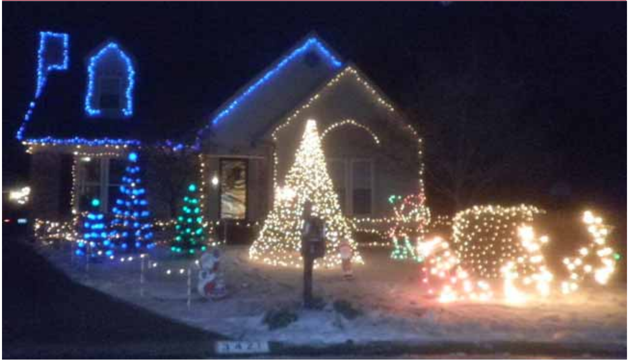
Above: House decorated in Westwood Farms neighborhood