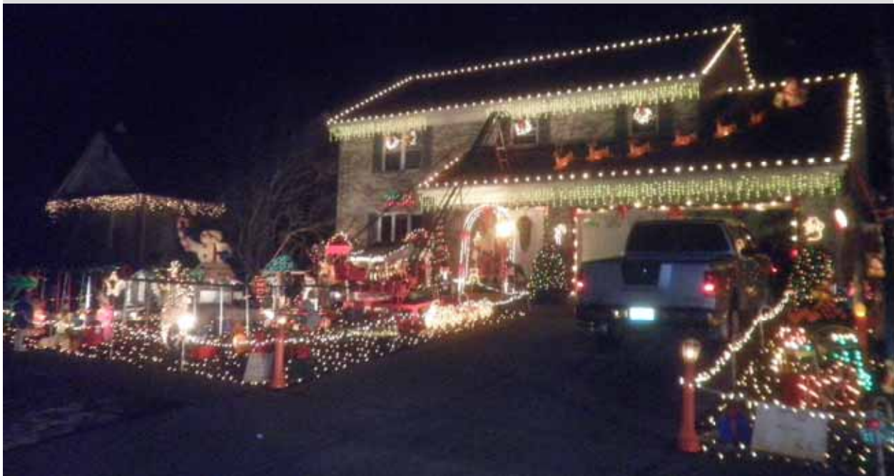
Below: 8913 Adams Run Court house at dark