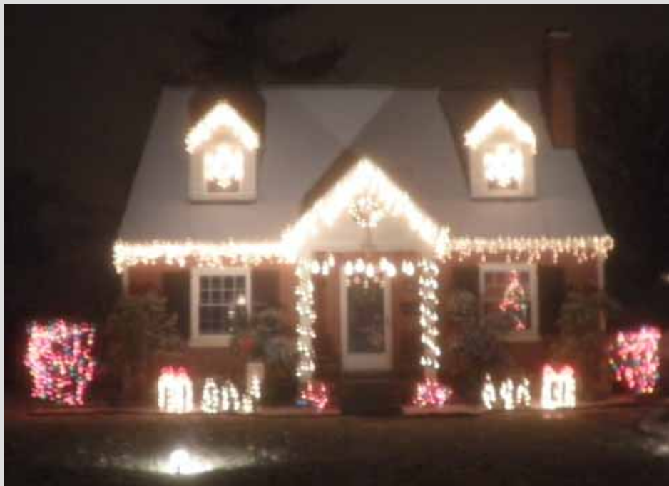
Below: House in Audubon Park neighborhood, which has many nice house displays