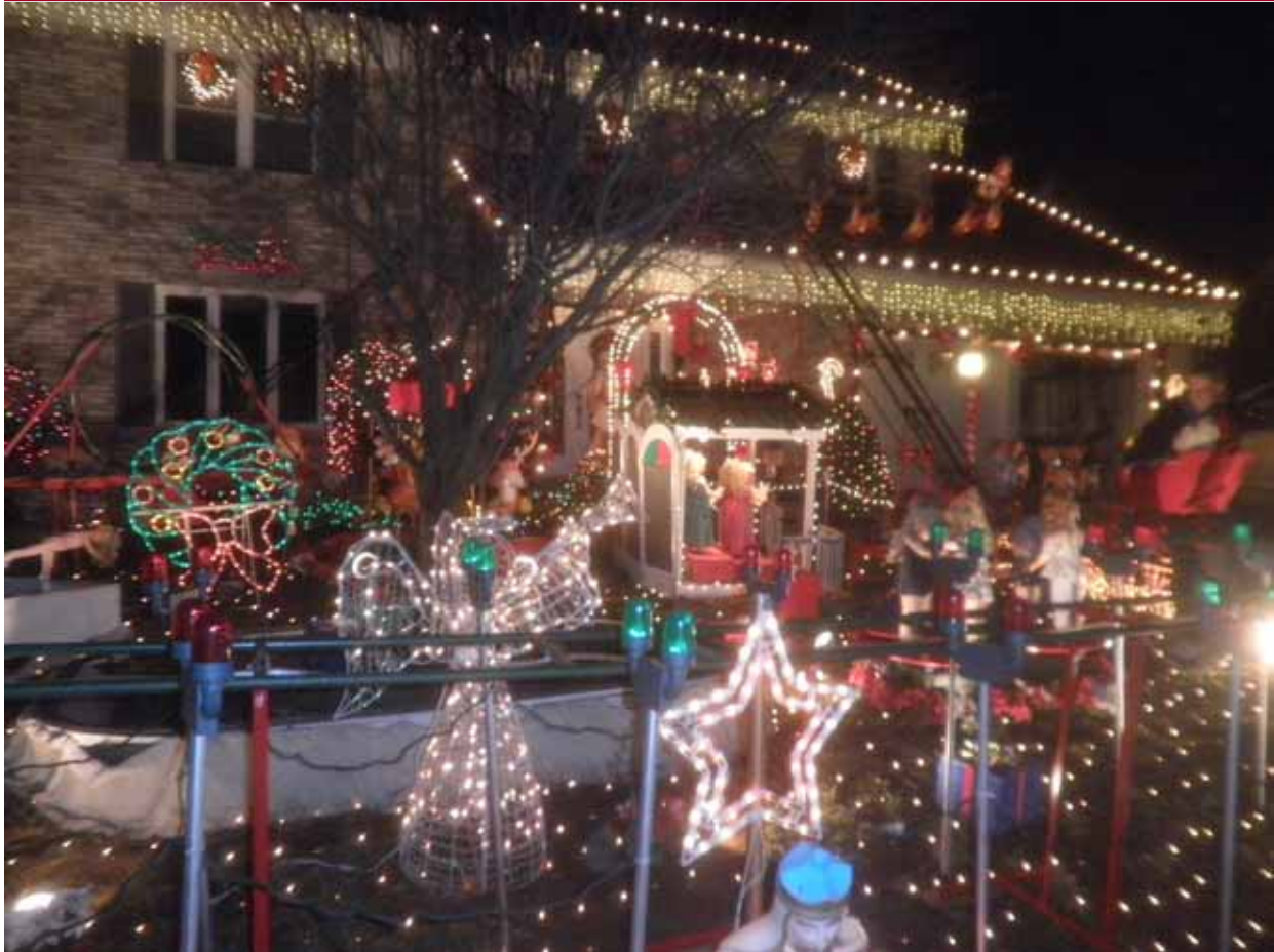
8913 Adams Run Court house at dark.