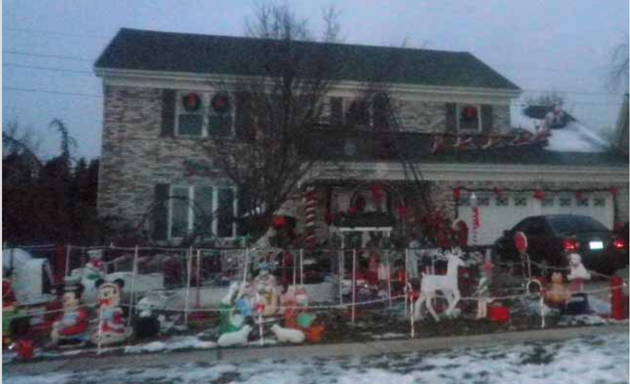
Above: 8913 Adams Run Court house, before it is dark.