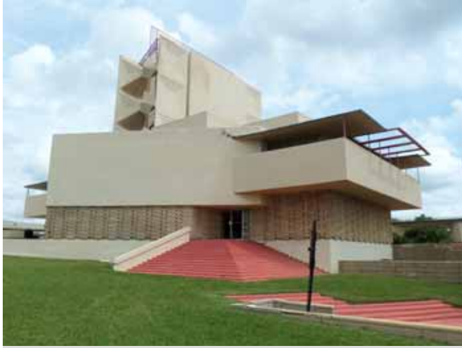
Ann Pfeiffer Chapel, 1941, which is currently under going restoration

Florida Southern College, in Lakland Florida, has the largest collection of Frank Lloyd Wright designed buildings for one client at a single location. They were designed between 1941 and 1948. Lakeland is located between Tampa and Orlando, on Interstate 4.