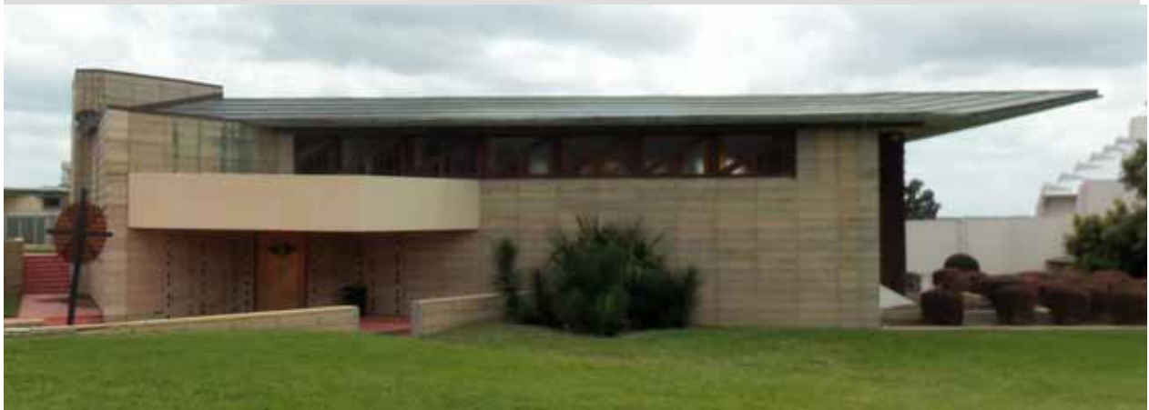
William Danforth Chapel