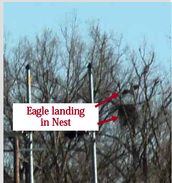
Eagle landing in Nest