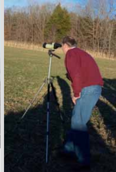
Above: Eagle roost with a cluster of about 21 eagles. Very cool!

While the eagles were at a distance, the tour had several long-range telescopes set-up and these allowed us to zoom in close where we can see the eagles in detail. Saturday evening, the Southwest High School, in Somerset, Ky., provided a demonstration of raptors ( below ). They have a raptor rehabilitation center that cares for injured, owls, hawks, eagles, etc. They do great work.