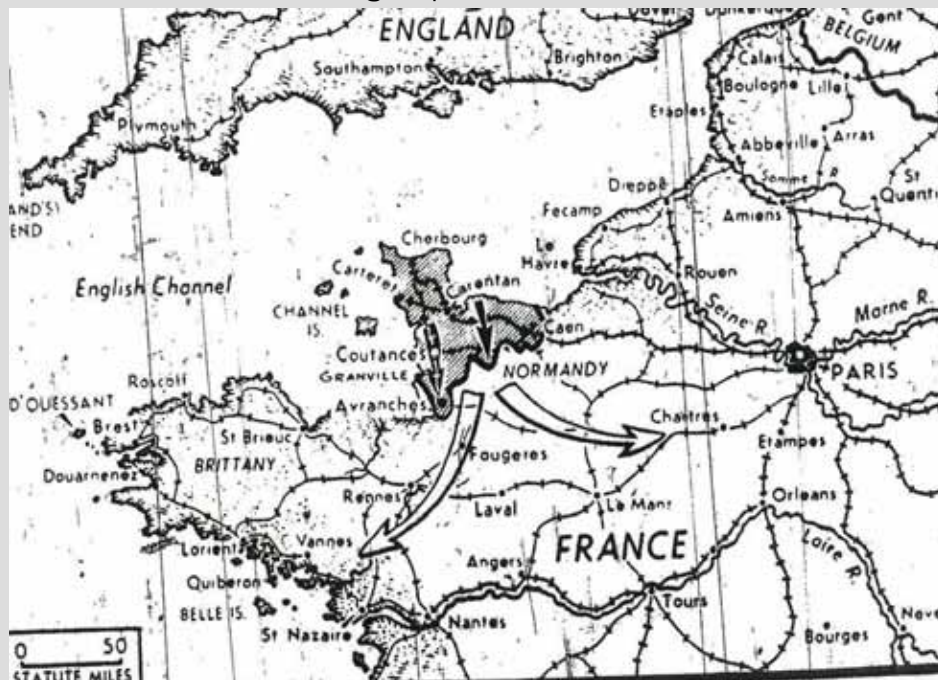
Normandy Invasion Military Positions as of August 1, 1944