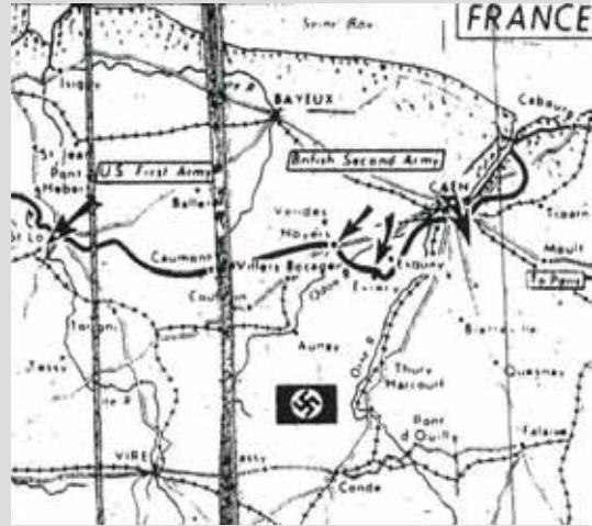
Normandy Invasion Military Positions as per July 19, 1944.

Back in Louisville, the Courier-Journal newspaper was full of war coverage. Banner headlines trumpeted victories. But, it was the second section that military families feared to read. Names of those killed in action were listed, along with those wounded. Most days contained four to six local men who would not return home, as well as dozens who were severely hurt in the fighting. Unlike today's instant communication systems, news traveled very slowly. Casualty reports were at least three weeks delayed. The anguish of loved ones who had to deal with the uncertain fate of their husbands, brothers, fathers, and sons overseas had to have been an excruciating experience.