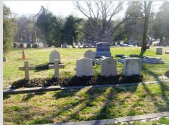
Belknap Family Plot in Louisville's Cave Hill Cemetery

It was a bright sunny Friday near 3 pm. The temperature would reach an unseasonable balmy 85 degrees on this spring day that felt more like summer. Flowers were in bloom. Dogwoods and azaleas were at their colorful peak. Slowly the funeral procession departed St. Mark's Episcopal Church on Frankfort Avenue in Crescent Hill. West along Grinstead Drive, past Cherokee Park, through the Cherokee Triangle neighborhood, and into the Broadway gates of Cave Hill Cemetery, the two black hearses traveled to lot 225 of section N.