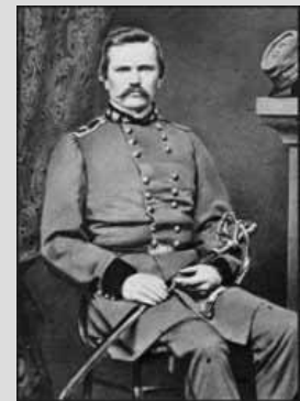
Simon Bolivar Buckner, Sr.